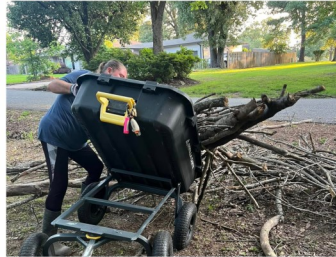
KI BOIS Haskell County sponsored the Whitefield Baptist Church youth to clean Roye Park in Stigler as their project. The Church trimmed trees, hauled limbs and picked up trash in preparation for the annual Rubber Duck Regatta.