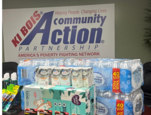
Muskogee County Office donates various items to RISE & Muskogee Housing Authority for distribution.