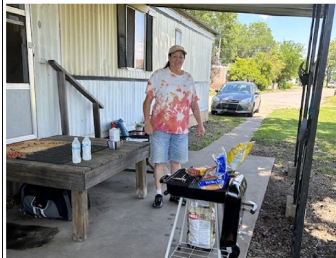
The Sallisaw office took on a project for a client who is going through cancer treatments and the struggles that come with that. They planted a flower garden, new lawn furniture and a new grill. They enjoyed a lunch of hot dogs and the trimmings.