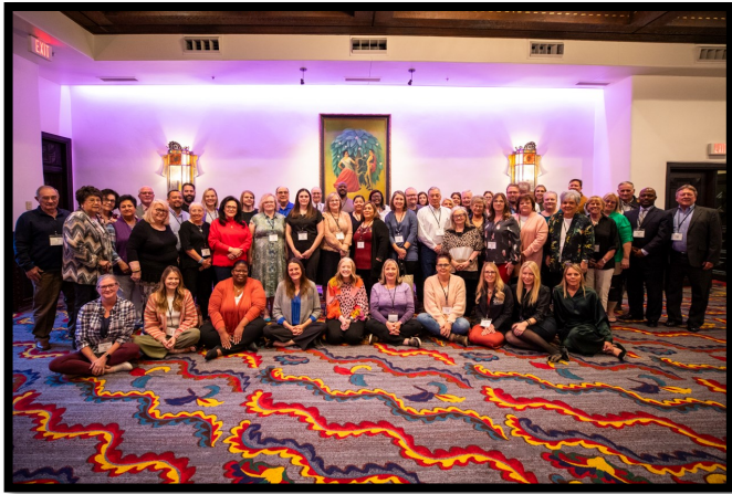
The Oklahoma Community Action Network made a strong presence at the Region VI Conference held in Santa Fe, New Mexico April 2-4. Can you find the five KI BOIS staff members who attended?